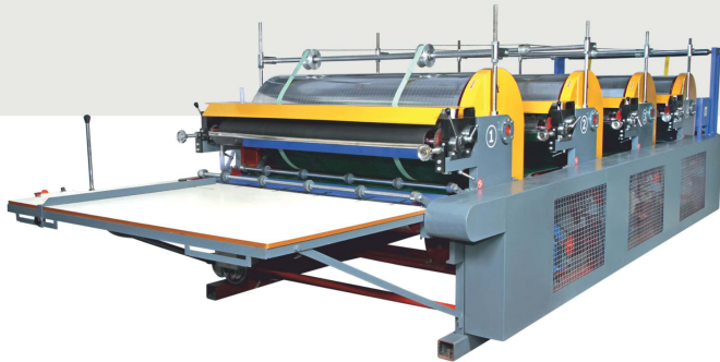
FIBC/JUMBO BAGS Fabric Printing Machine