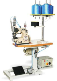
AS-7002 UDDR - PHS with Special Stand Table