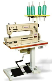
AS-1000 LA with Special Stand & Table (Baffle Bag)