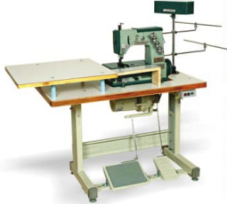
AS-502 JHD with Stand, Table & Motor