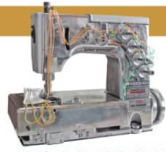
Stainless Steel Cover for Food Grade Bags.

ARMSTRONG® "DO BUSINESS LIFELONG, WITH ARMSTRONG"