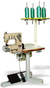
AS-802 VMC with Special Stand & Table (Spout Bag)